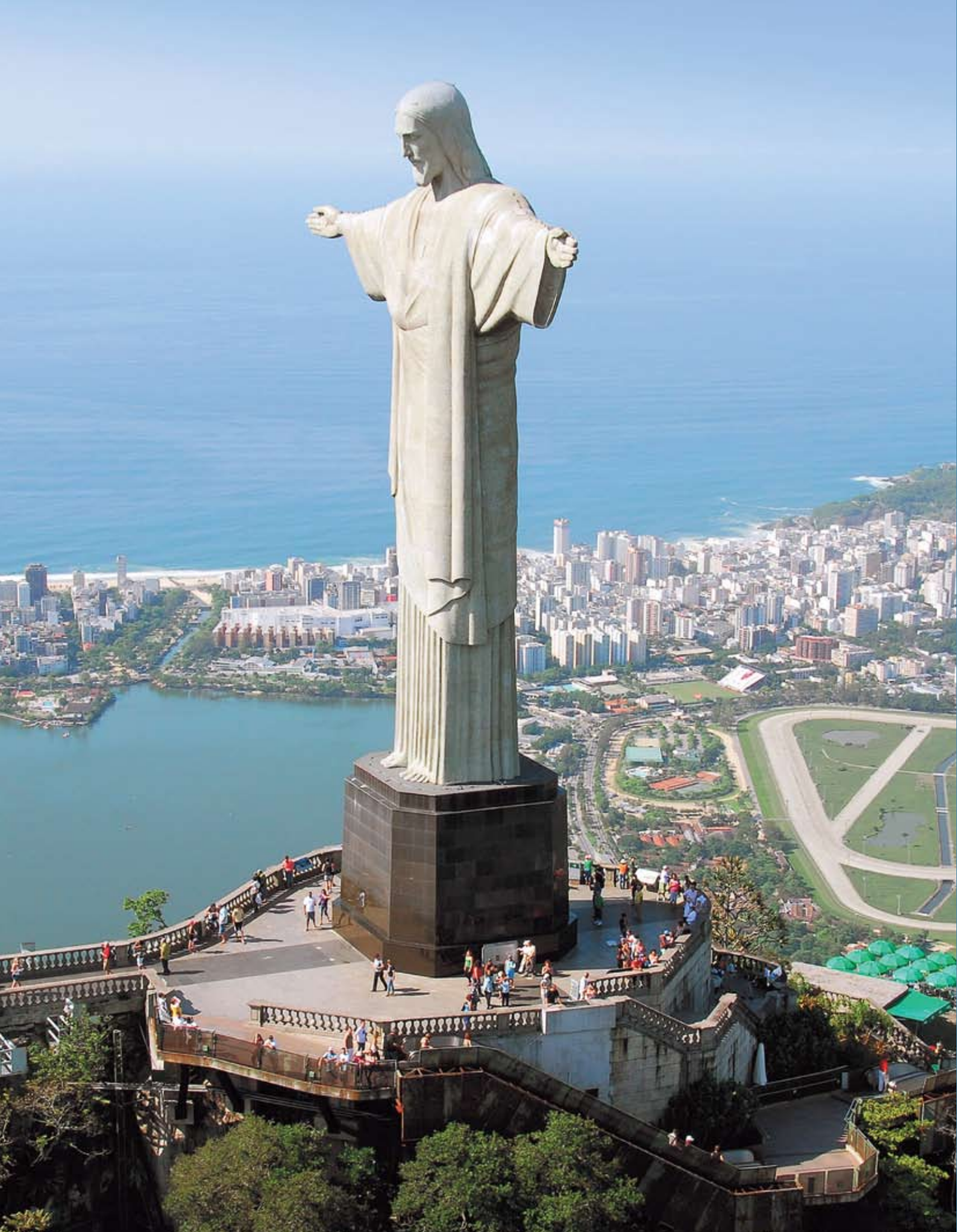
Aerial view of Christ the Redeemer.