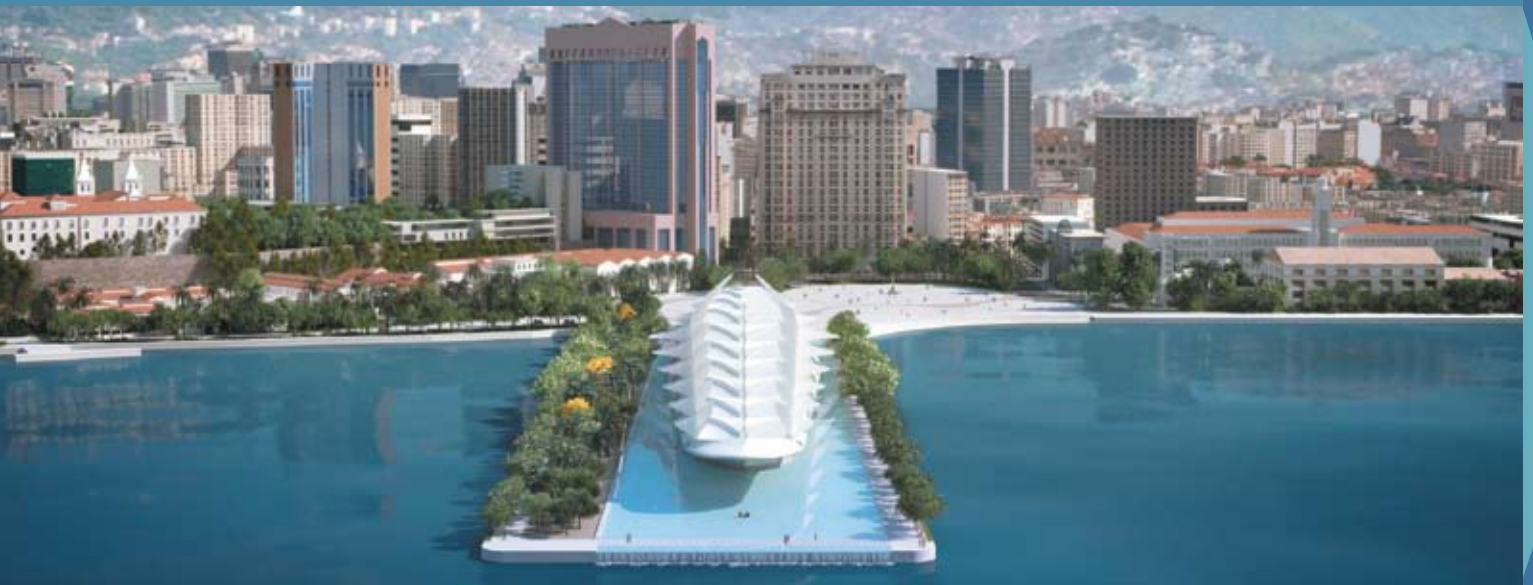
Model of the Museum of Tomorrow. This project is part of Rio's port area revitalization.